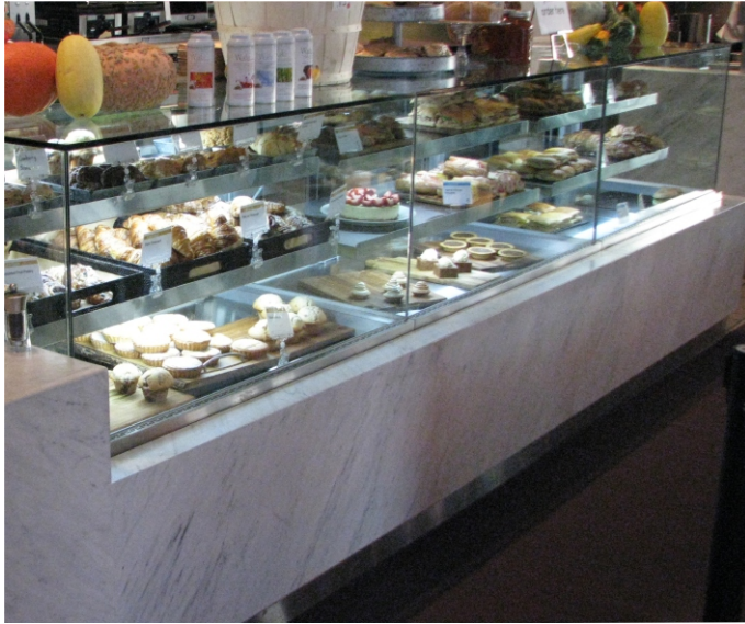
SQR 4848 W/STAINLESS STEEL SHELVES